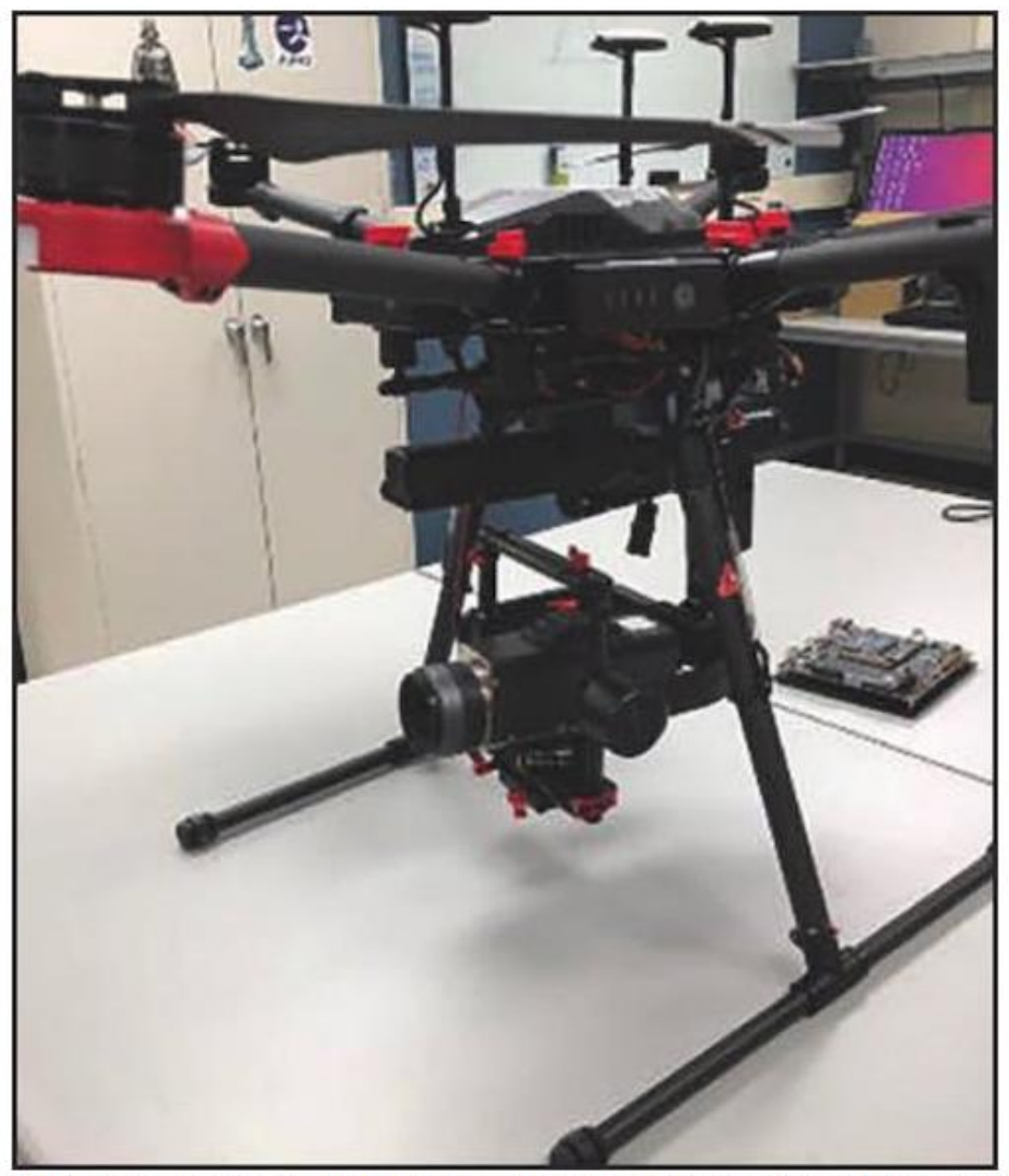
Methane leak detection technology combines remote sensing and artificial intelligence capabilities in a system that can operate from an aerial platform — an approach that can more effectively help alleviate methane emissions from multiple operations in the natural gas industry.

Functional materials development focuses on the design, synthesis, physical characterization, and performance testing of the nanomaterials, polymers, porous sorbents, ionic liquids, and electro-ceramics required for the next generation of carbon capture, gas separation, chemical looping, solid oxide fuel cell, chemical sensing, fuel processing, and carbon materials technologies. NETL also has capabilities for designing, developing, and prototyping magnetic alloys that improve the performance of power converters and the electrical grid.