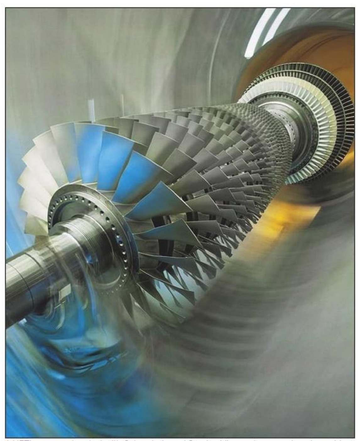
A NETL-managed project with Colorado-based Sporian Microsystems produced smart temperature sensors that can operate up to 1800 °C as well as pressure sensors that operate at temperatures up to 1600 °C for improved performance in monitoring gas turbines, combustion systems, and more.